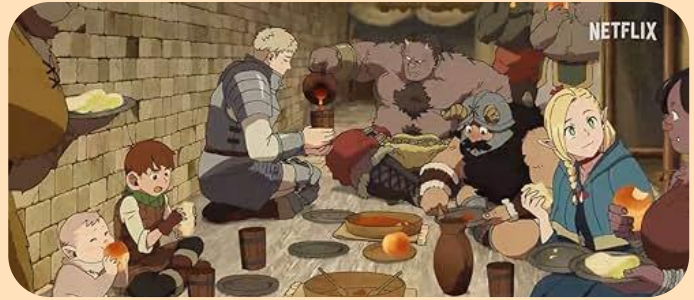
Delicious in The Dungeon - Netflix

Delicious in the dungeon is a very different style of anime set in a dungeons and dragons esque world where adventurers can make fortunes by diving bravely into the depths of a massive castle buried under the ground. Inside this castle/ dungeon one may find many traps and monsters, so when the protagonists run out of money for food when trying to rescue a party member they must