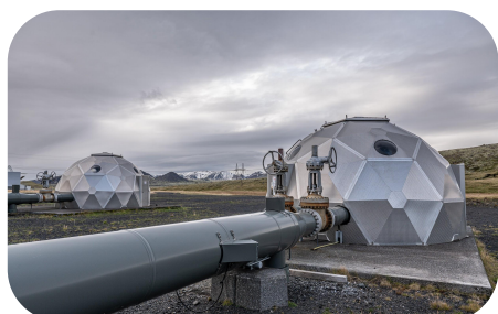
The Icelandic Orca carbon capture plant aims to clean up a mess by capturing the carbon we emit, and store it underground.